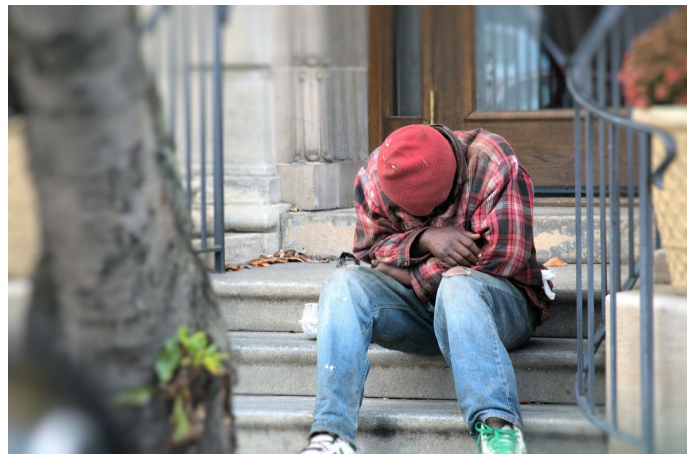
"Tired" by Steve, PhotoVoice Digital Exhibit, Daily Planet, Richmond, VA

Dr. Crosland offers Washington, DC's Interagency Council on Homelessness as an example of a municipal body that is seeking to improve care coordination across the systems involved in IC/CC, by bringing together as many stakeholders as possible for multiweek conversations, culminating in a practical document that states: